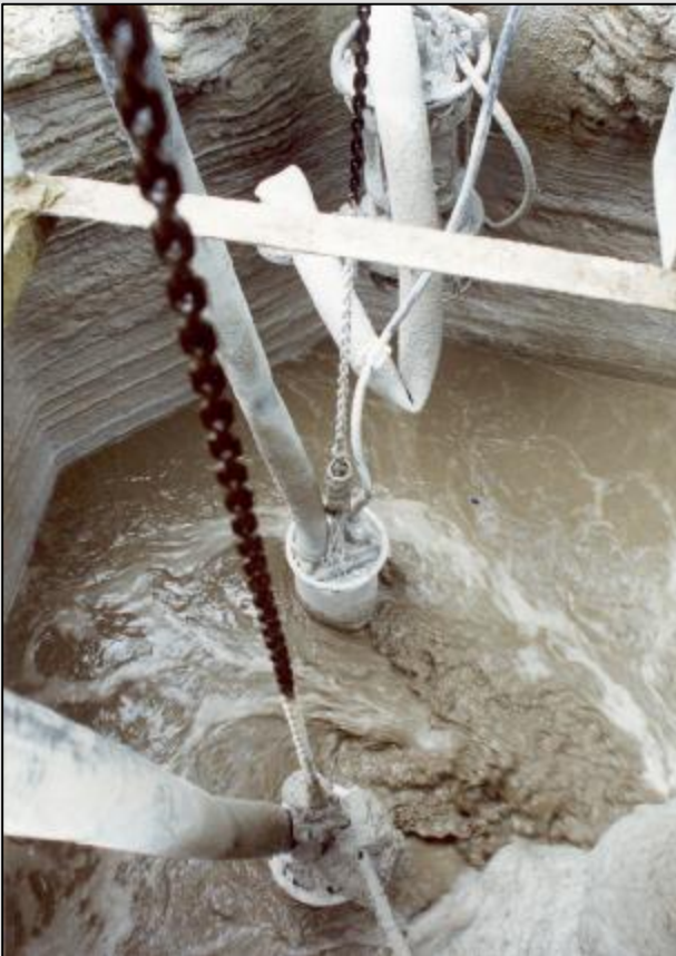
ET10 and DP10 Pumps Concrete factory