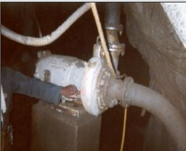
VH20 Pump Mining industry

TOYO pumps have been in operation for more than 50 years in many applications, notably :