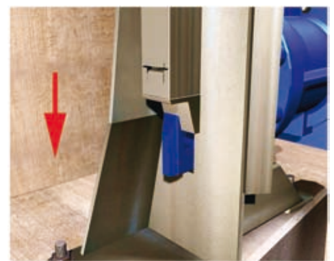
Locking (inside view)